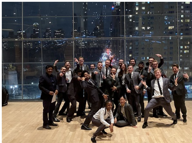
MSU Jazz Orchestra I having a lighthearted moment in the Appel Room at Jazz at Lincoln Center before their evening performance. The camaraderie among the group made their playing infectious and added to the fun of an amazing weekend.