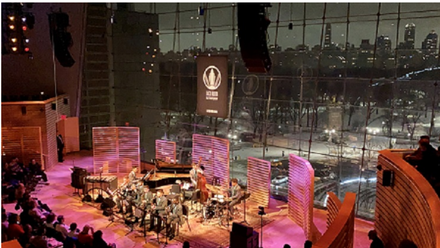
MSU Jazz Octet I performing in the Appel Room as part of the combo showcase at Jazz at Lincoln Center, January 18, 2020. The enthusiastic Spartans in the crowd cheered for the MSU students all weekend.